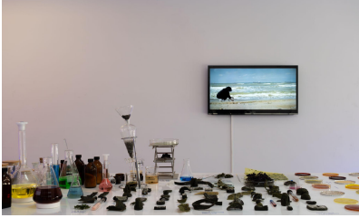
Zümra Çetinler, Sustainable Traces: a Study of Kısırkaya, 2023, bio-based materials, laboratory equipments and video installation, 100 x 200 x 70 cm, 9'23''