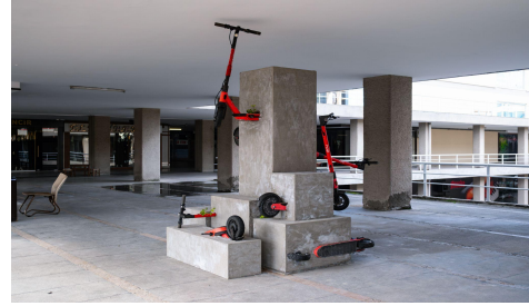
Eren Yıldırım, E-merge, 2023, electric scooter scraps, plaster on wood and hederia helix, 270 x 250 x 230 cm