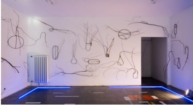
Meriç Kara, Surplus, 2023, mass-produced metal parts and surplus branches, various sizes